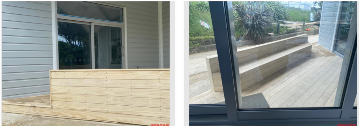
Views of the classroom interior